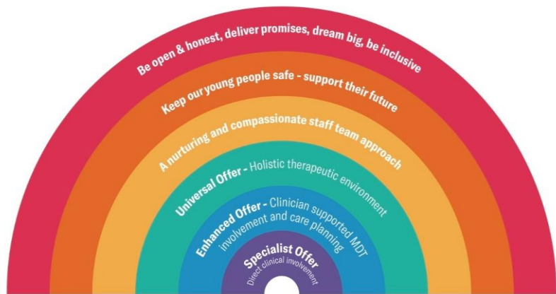
The red and orange stripes apply to every OFG employee

Our therapeutic offer is informed by the OFG Wellbeing Rainbow; this strategy places wellbeing at the core of everything we do. The rainbow represents a tiered approach to wellbeing support at a multi-professional level: